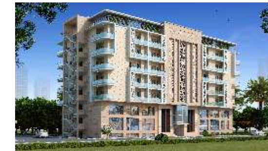
CINE GRAND COMMERCIAL & RESIDENTIAL 3 BHK APARTMENT Hazratganj, Lucknow