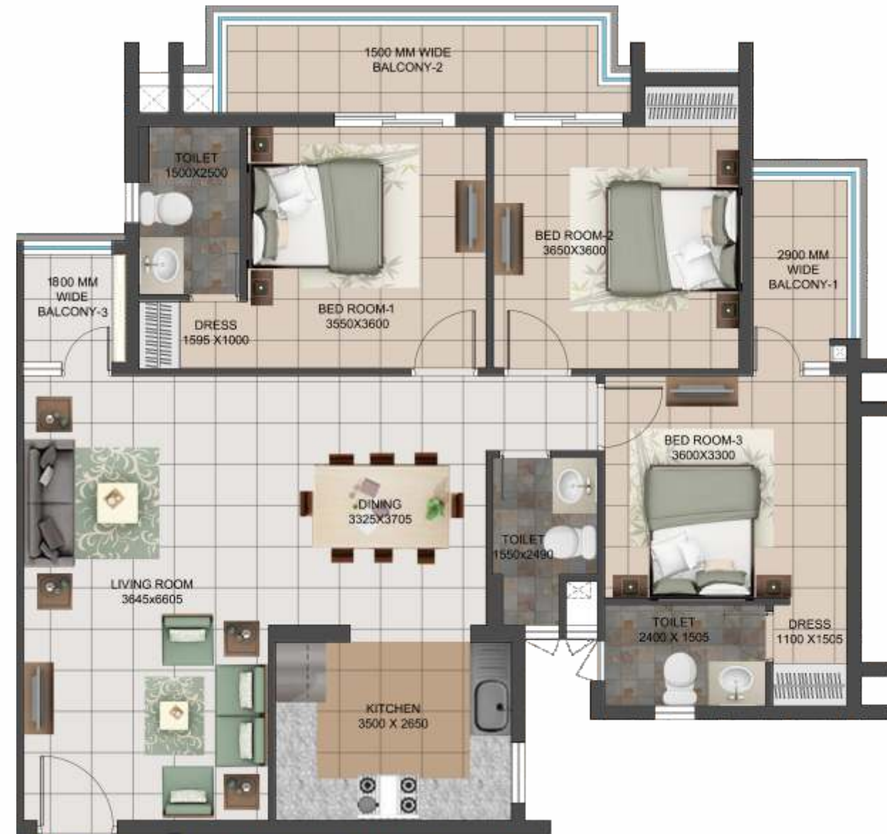
UNIT TYPE: 3 BHK AREA: 1800.00 Sq.Ft (167.22 Sq. Mtr.)