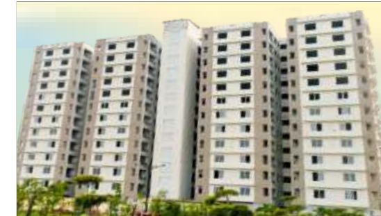
GREENS 1, 2 & 3 BHK APARTMENTS Naubasta Kala, Deva Road, Lucknow