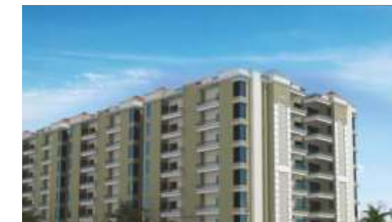
VISION 3 BHK + SERVANT APARTMENTS Moti Nagar, Aishbagh, Lucknow