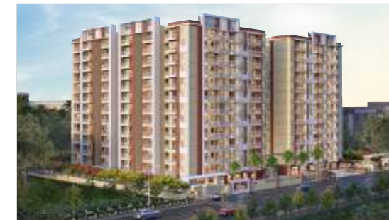
DAFFODILS 2, 3 & 4 BHK APARTMENTS Sector 14, Vrindavan Yojna, Lucknow