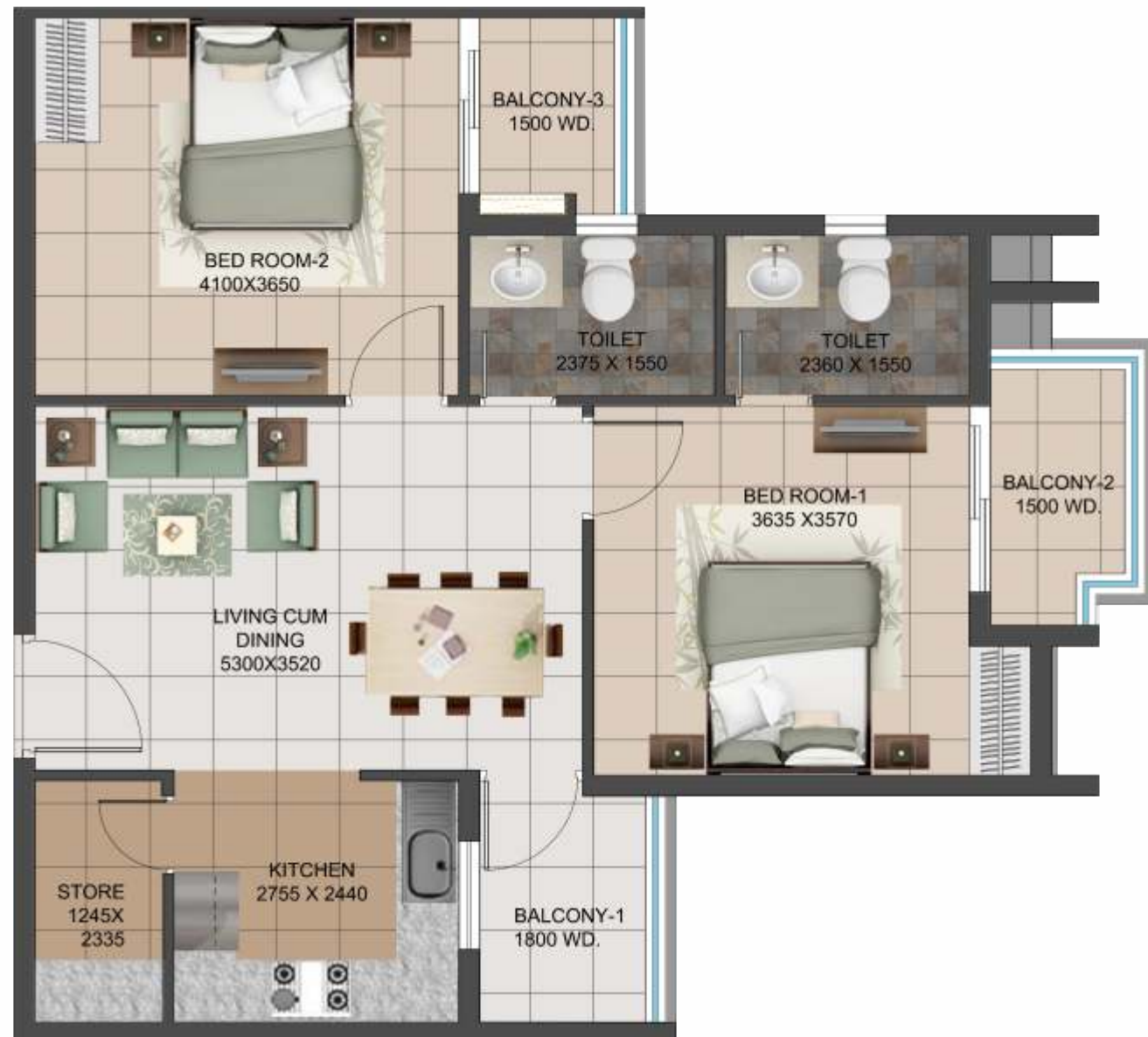
UNIT TYPE: 2 BHK AREA: 1160.00 Sq.Ft (107.76 Sq. Mtr.)