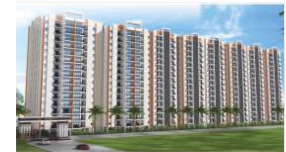
HEIGHT 2 & 3 BHK APARTMENTS & LUXURY VILLA Raebareli Road, Near PGI, Lucknow