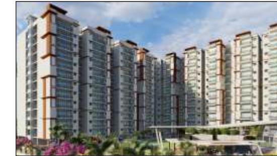
ENCLAVE 2 & 3 BHK APARTMENTS Kanpur Road, Lucknow