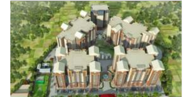
ESTATE 3 BHK APARTMENTS Gomti Nagar, Lucknow