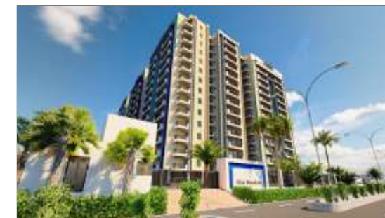
BLUE MOUNTAIN 2 & 3 BHK APARTMENTS Sector 17, Vrindavan Yojna, Lucknow