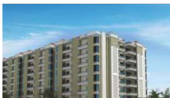
VISION 3 BHK + SERVANT APARTMENTS Moti Nagar, Aishbagh, Lucknow