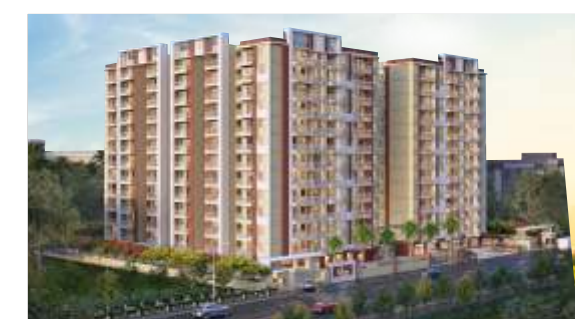
DAFFODILS 2, 3 & 4 BHK APARTMENTS Sector 14, Vrindavan Yojna, Lucknow