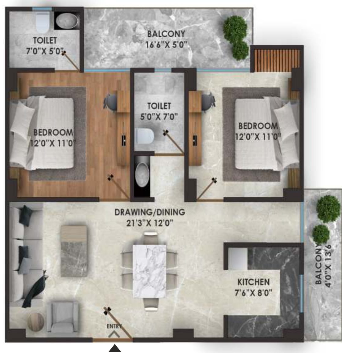
UNIT TYPE: 2 BHK (T-1) AREA - 1125 Sq. Ft. (104.51 Sq.Mtr.)