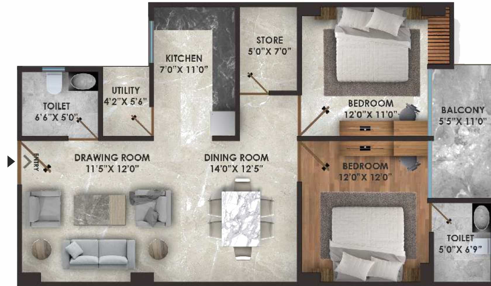
UNIT TYPE: 2 BHK (T-3) AREA - 1170 Sq. Ft. (108.69 Sq.Mtr.)