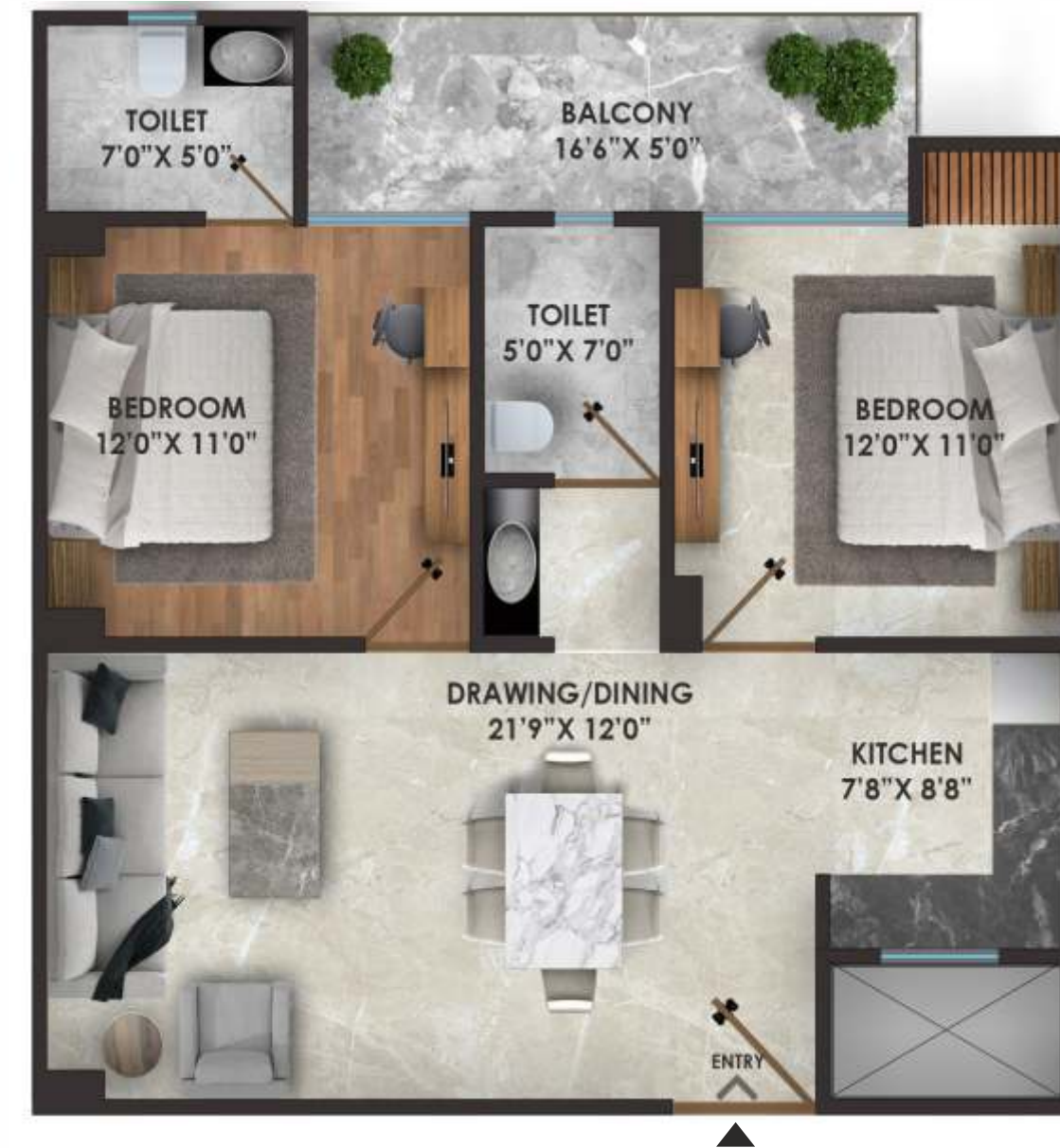
UNIT TYPE: 2 BHK (T-2) AREA - 1050 Sq. Ft. (97.54 Sq.Mtr.)