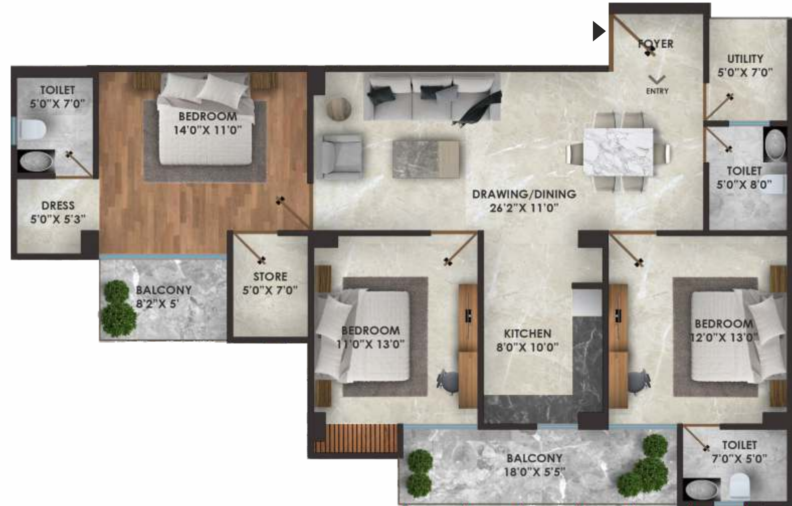
UNIT TYPE: 3 BHK AREA - 1690 Sq. Ft. (157.00 Sq.Mtr.)