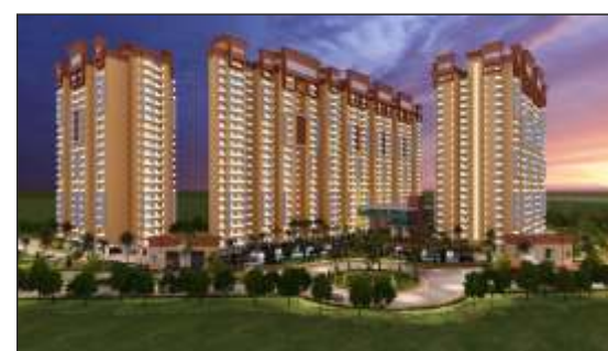
GRAND 2, 3 & 4 BHK APARTMENTS Main Faizabaad Road, Lucknow