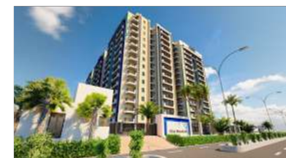
BLUE MOUNTAIN 2 & 3 BHK APARTMENTS Sector 17, Vrindavan Yojna, Lucknow