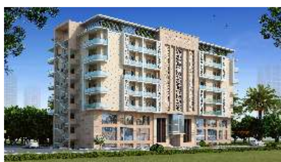
CINE GRAND COMMERCIAL & RESIDENTIAL 3 BHK APARTMENT Hazratganj, Lucknow