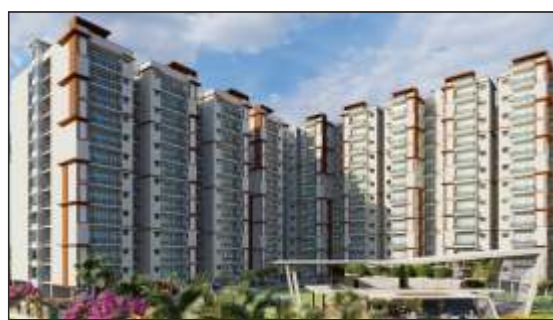
ENCLAVE 2 & 3 BHK APARTMENTS Kanpur Road, Lucknow