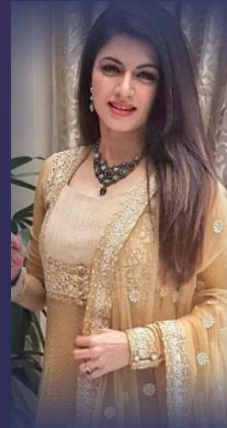
Bhagyashree Bollywood Actress