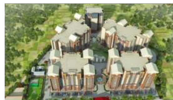
ESTATE 3 BHK APARTMENTS Gomti Nagar, Lucknow