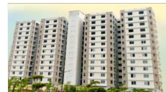
GREENS 1, 2 & 3 BHK APARTMENTS Naubasta Kala, Deva Road, Lucknow