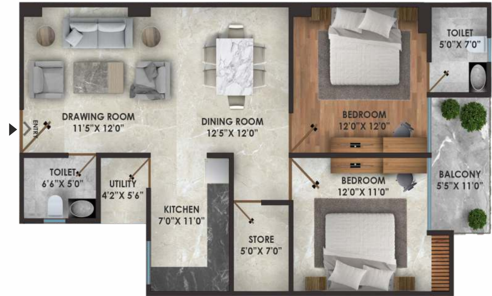
UNIT TYPE: 2 BHK (T-4) AREA - 1150 Sq. Ft. (106.83 Sq.Mtr.)